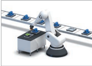
Robotics and Tool Changing